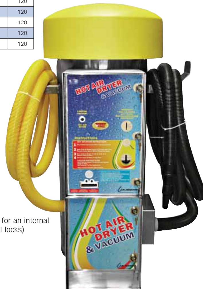
9215LDV SHOWN WITH OPTIONAL YELLOW DOME AND YELLOW HOSE