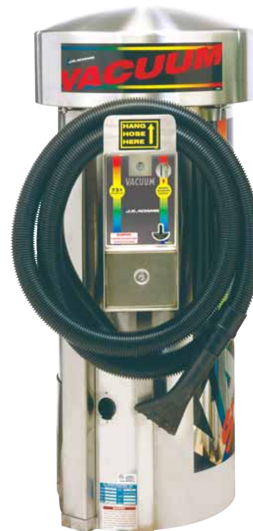
SUPER VAC 9230 SHOWN WITH OPTIONAL SERVICE DOOR SECURITY COVER