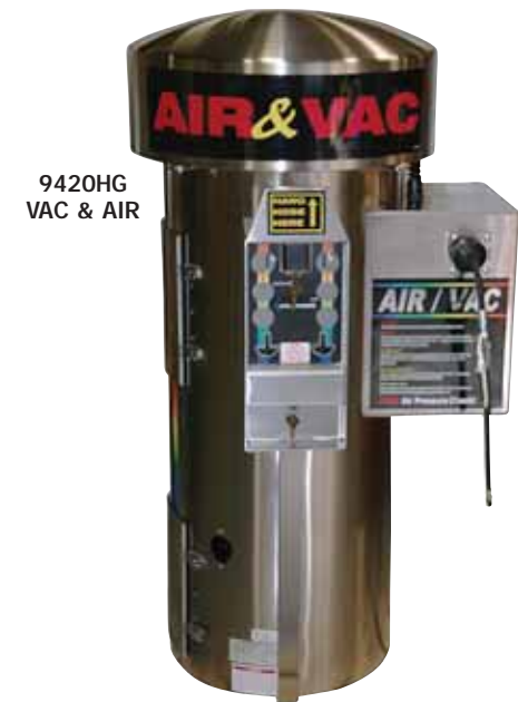
9420HG VAC & AIR