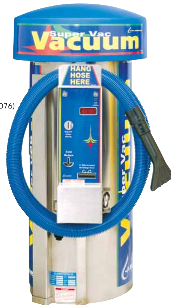
SUPER VAC 9200-1LD SHOWN WITH OPTIONAL BLUE DOME, BLUE HOSE, BLUE DECAL PACKAGE, SERVICE DOORS SECURITY COVER, AND COIN BOX SECURITY PACKAGE