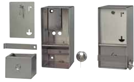
6165 UNASSEMBLED AND 6165 ASSEMBLED