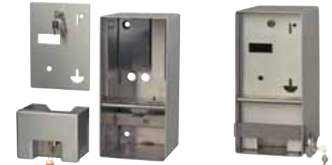
6175 UNASSEMBLED AND 6175 ASSEMBLED SHOWN WITH OPTIONAL DIGITAL FACEPLATE