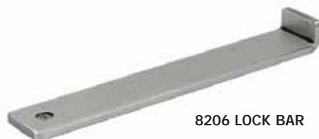
8206 LOCK BAR