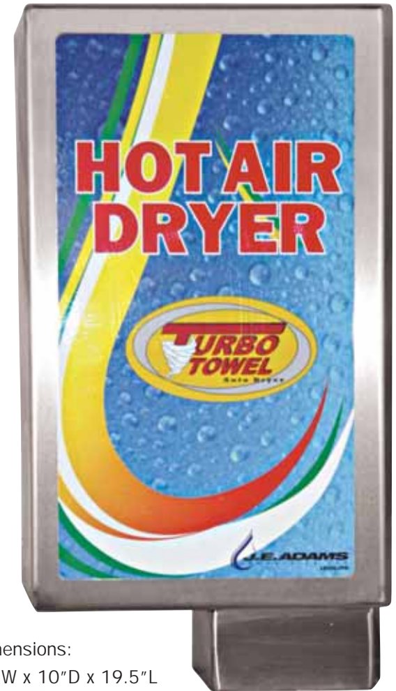
Dimensions: 10"W x 10"D x 19.5"L