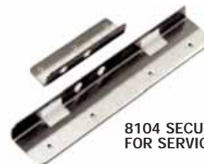
8104 SECURITY KIT FOR SERVICE DOOR

RETRO KIT NOW AVAILABLE ITEM #9427K-RETRO