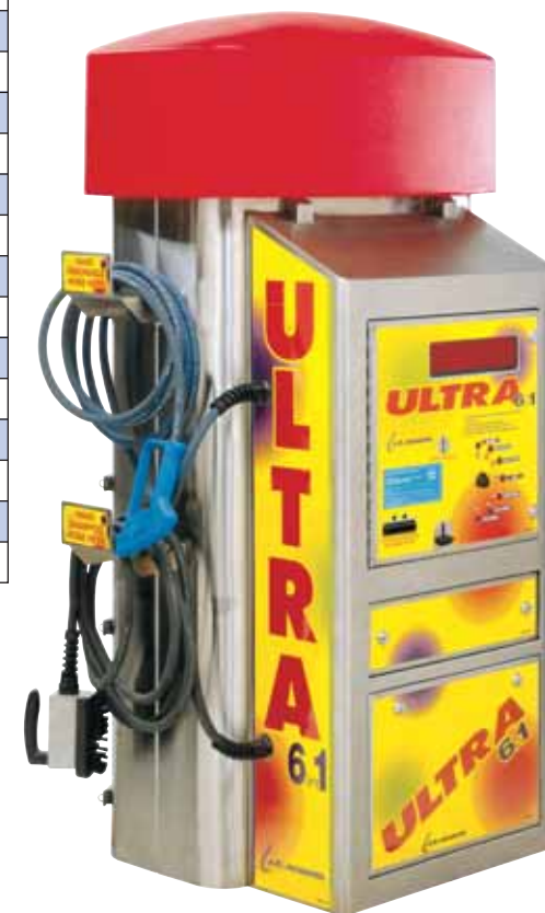
28000 ULTRA SERIES COMBINATION VACUUM SHOWN WITH OPTIONAL RED DOME