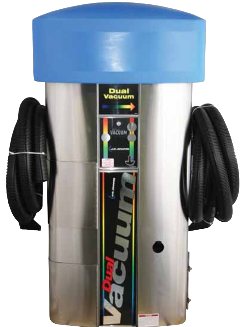
8960 DUAL VAC SHOWN WITH STANDARD BLUE DOME AND BLACK HOSES