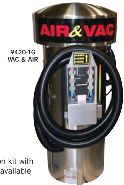
9420-1G VAC & AIR