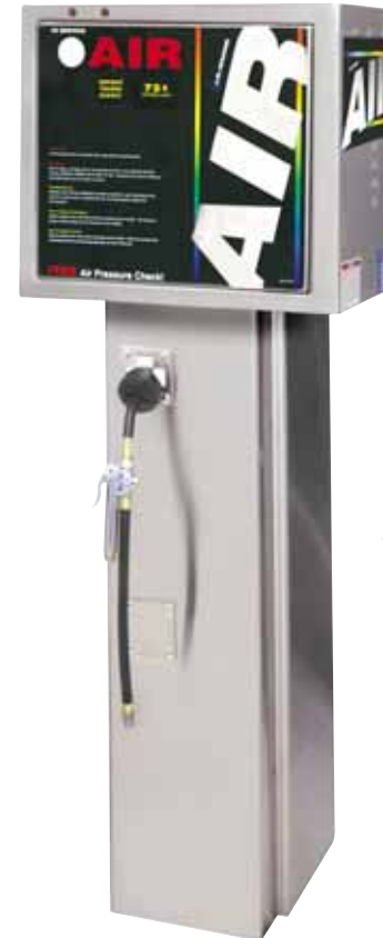
8670-2BGA AIR MACHINE ON OPTIONAL 6026 BASE (SOLD SEPARATELY)