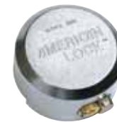
COIN BOX AND AMERICAN 2000 SERIES LOCK (8920-1T)