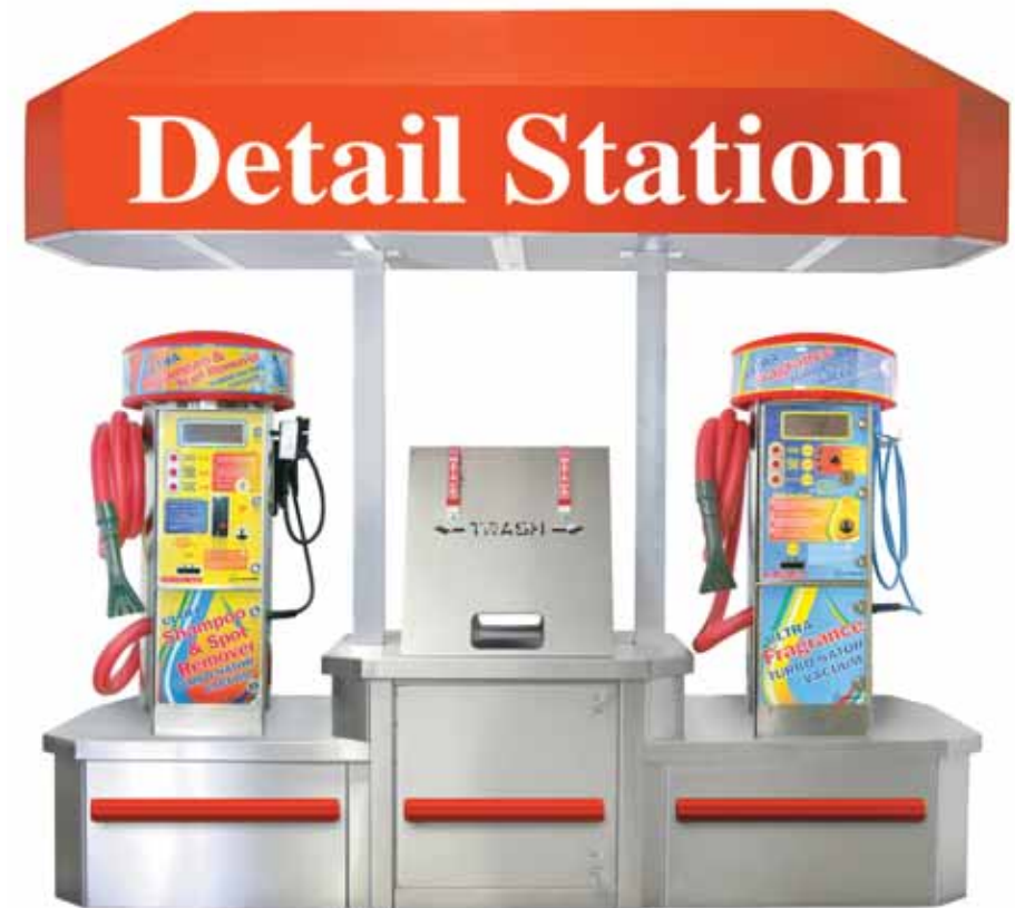
Ultra 10' Vacuum Island Base (32010) and Canopy (32010CAN) with Ultra Turbo-Nator® Shampoo and Spot Remover and Ultra Turbo-Nator® Fragrance Combination Vacuums