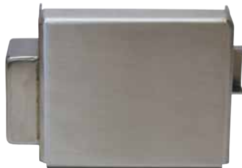
8202W SECURITY COVER FOR COIN BOX