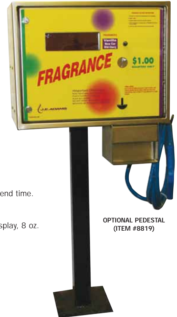
OPTIONAL PEDESTAL (ITEM #8819)