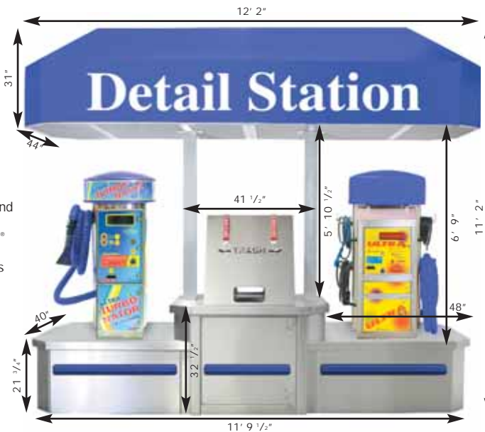
Ultra 12' Vacuum Island Base (32012) and Canopy (32012CAN) with Ultra Turbo-Nator® and Ultra 6-in-1 Combination Vacuums