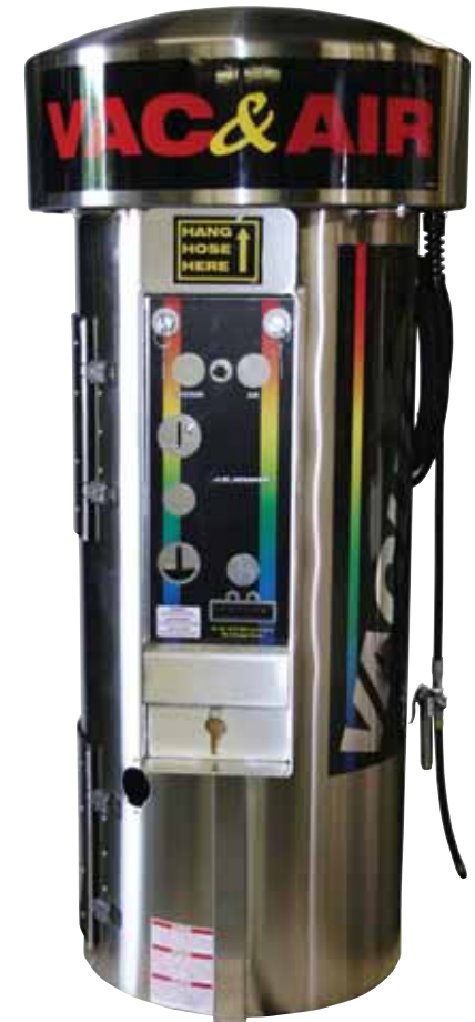
9420-5GV VAC & AIR WITH BILL ACCEPTOR