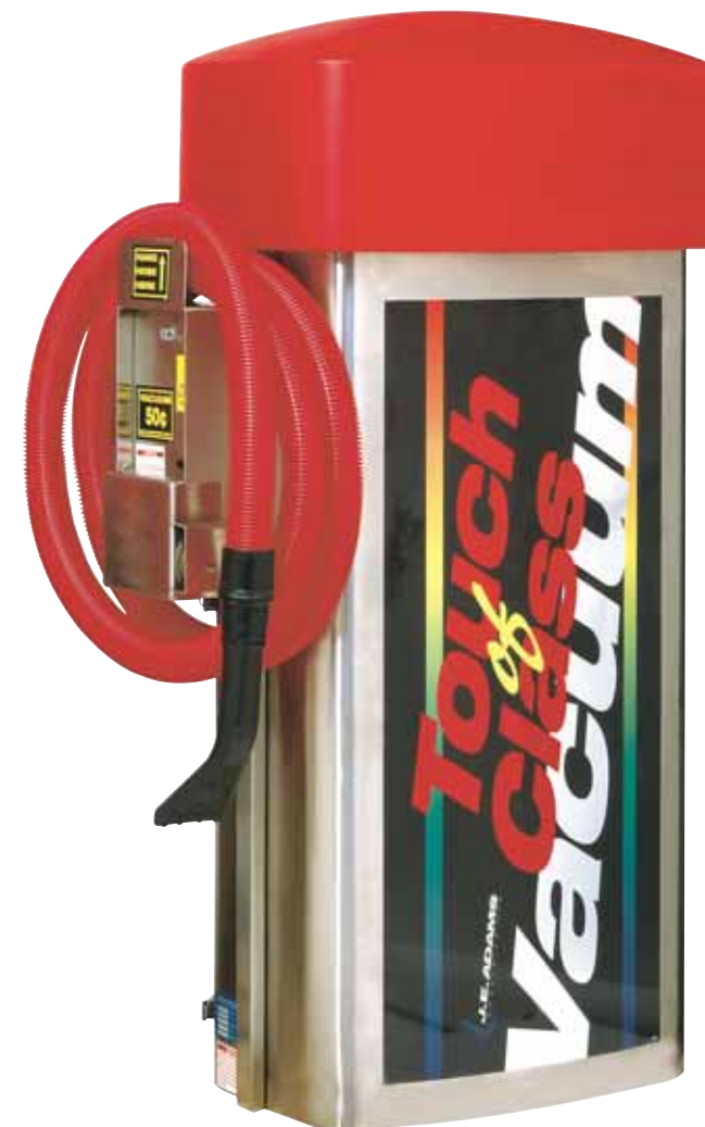
8930 OVAL VAC SHOWN WITH OPTIONAL RED DOME, RED HOSE, COIN BOX SECURITY COVER (ITEM #8940-1W), LOCK BAR (ITEM #8206), AND ABUS LOCK (ITEM #6024)