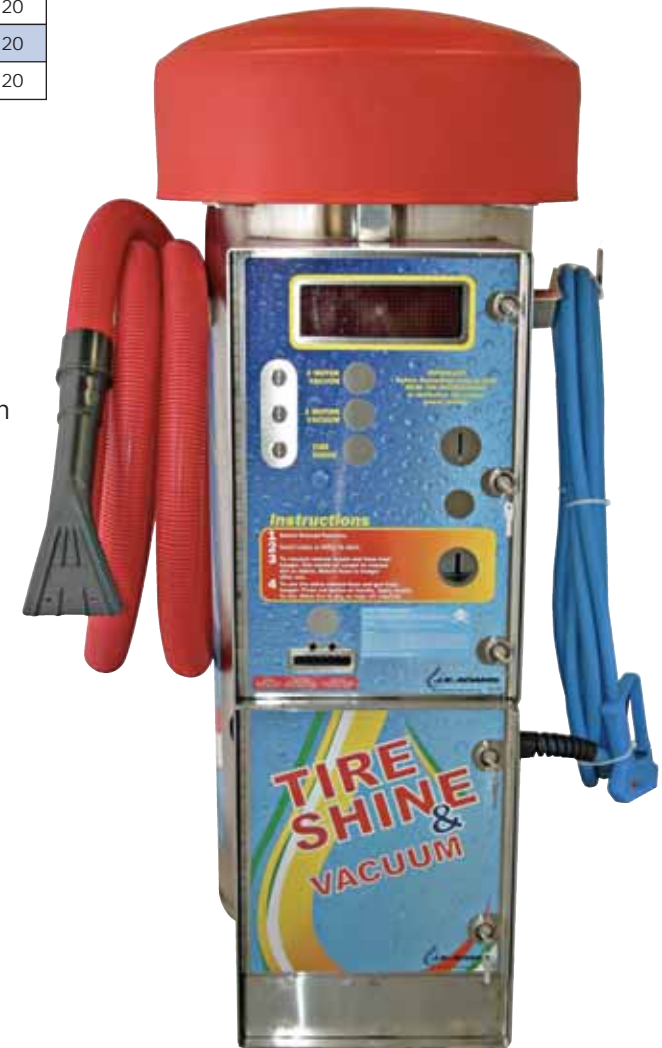
ULTRA SERIES 29035 SHOWN WITH STANDARD BLUE DECAL, AND OPTIONAL RED HOSE AND RED DOME