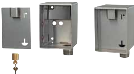
6055 UNASSEMBLED AND 6055 ASSEMBLED