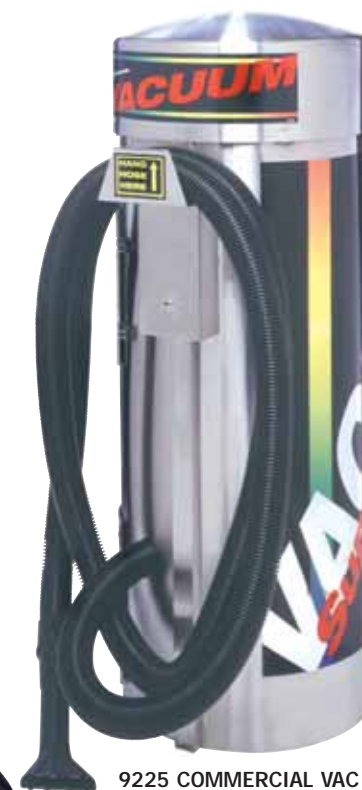
9225 COMMERCIAL VAC