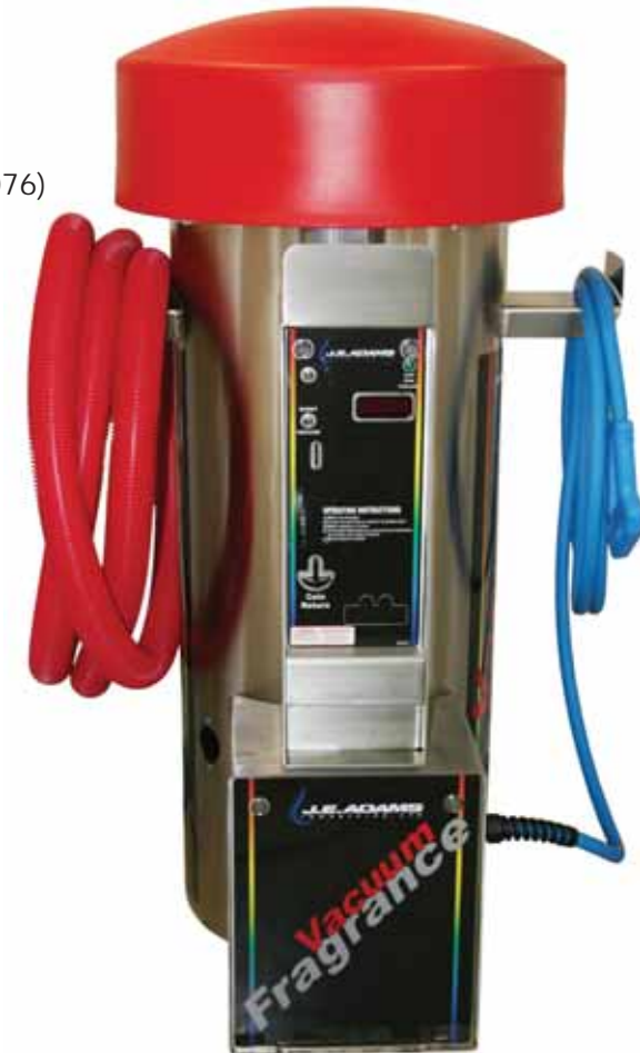
8900-110V VAC SCENT-SATIONS SHOWN WITH OPTIONAL RED DOME AND RED HOSE

8855 Strawberry 8859 New Car 8856 Pina Colada 8865 French Vanilla 8857 Wild Cherry 8870 Lemon-Lime