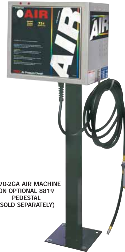
8670-2GA AIR MACHINE ON OPTIONAL 8819 PEDESTAL (SOLD SEPARATELY)