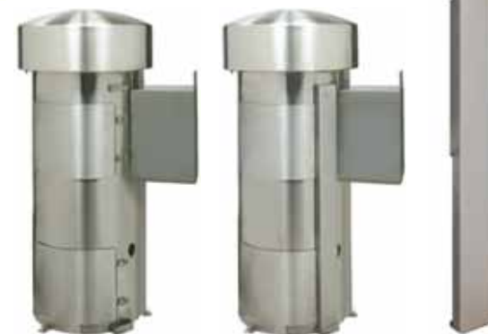
VACUUM WITHOUT 9427K (LEFT), VACUUM WITH 9427K (CENTER), AND 9427K (RIGHT)

RETRO KIT NOW AVAILABLE ITEM #9427K-RETRO