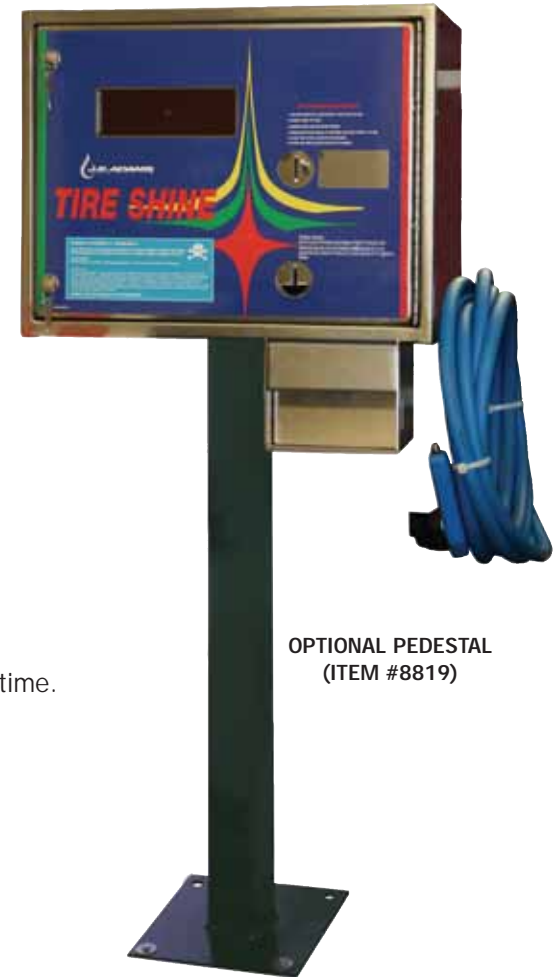
OPTIONAL PEDESTAL (ITEM #8819)