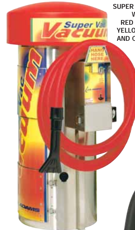
SUPER VAC 9213LD SHOWN WITH OPTIONAL RED DOME, RED HOSE, YELLOW DECAL PACKAGE AND COIN BOX SECURITY PACKAGE