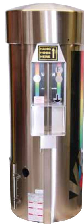
8100 WITH ANGLED LOCK BAR