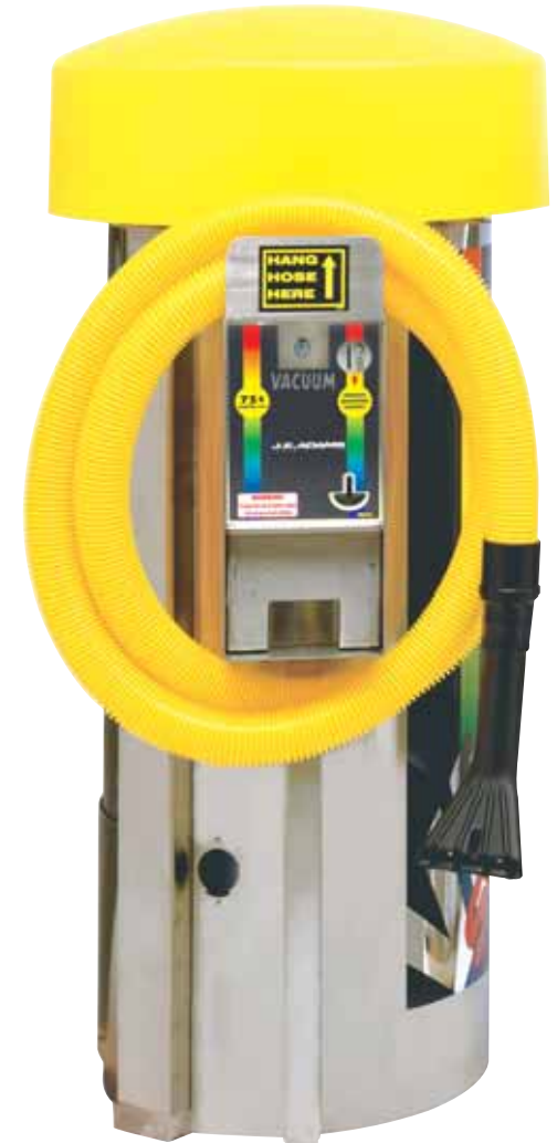
SUPER VAC 9250LD SHOWN WITH OPTIONAL YELLOW DOME, YELLOW HOSE, AND SERVICE DOOR SECURITY COVER