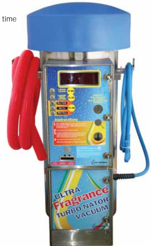
ULTRA SERIES 29015 SHOWN WITH OPTIONAL BLUE DECAL PACKAGE, BLUE DOME, AND RED HOSE