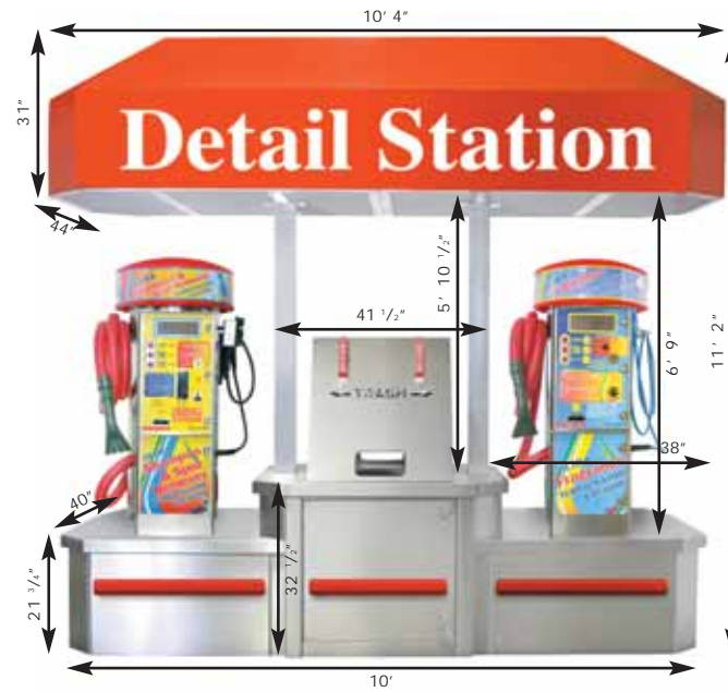
Ultra 10' Vacuum Island Base (32010) and Canopy (32010CAN) with Ultra Turbo-Nator® Shampoo and Spot Remover and Ultra Turbo-Nator® Fragrance Combination Vacuums