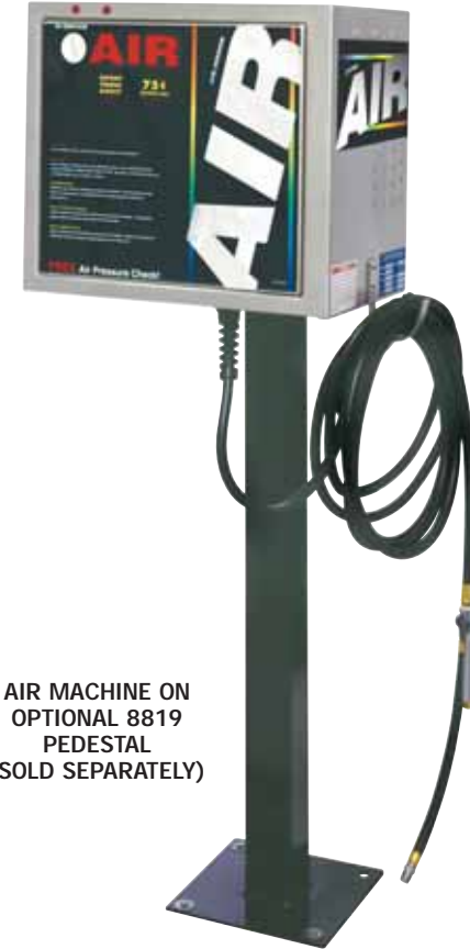
AIR MACHINE ON OPTIONAL 8819 PEDESTAL (SOLD SEPARATELY)