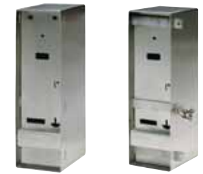
19000, 19000 SHOWN WITH 8206 & 6024