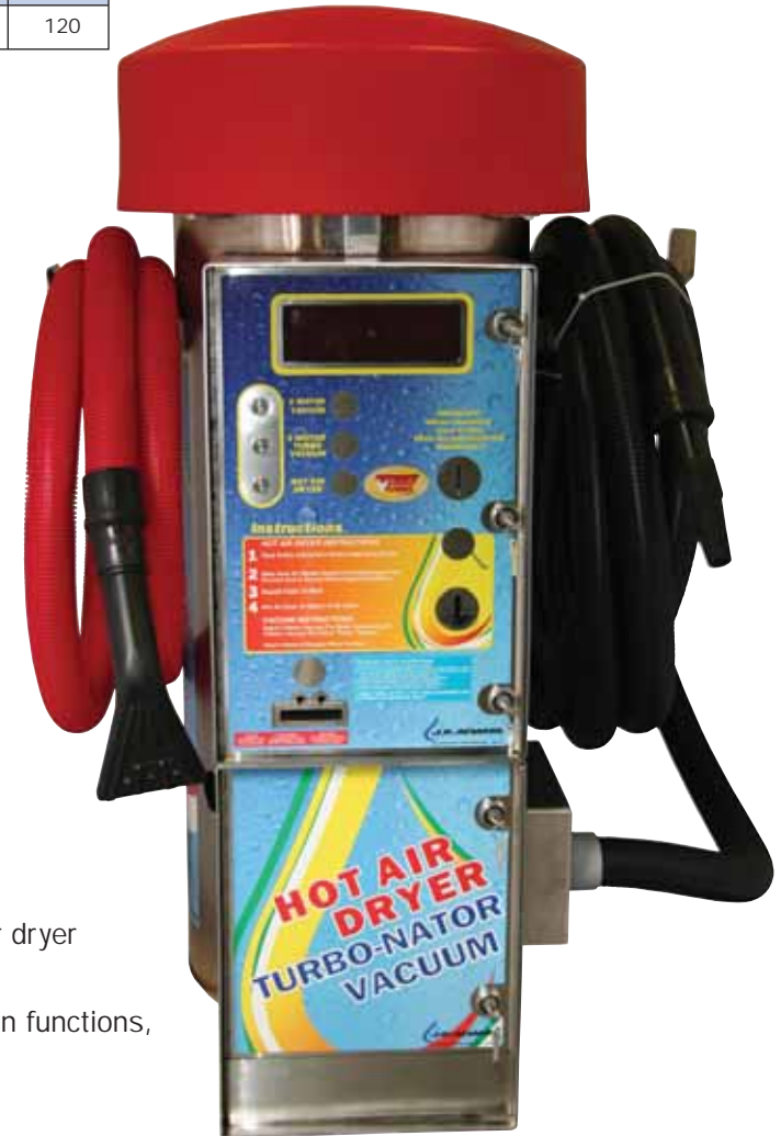
29050 SHOWN WITH OPTIONAL RED DOME AND RED HOSE