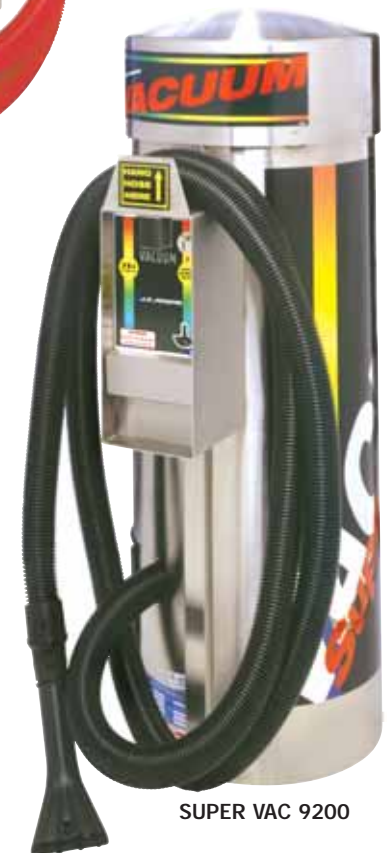
SUPER VAC 9200