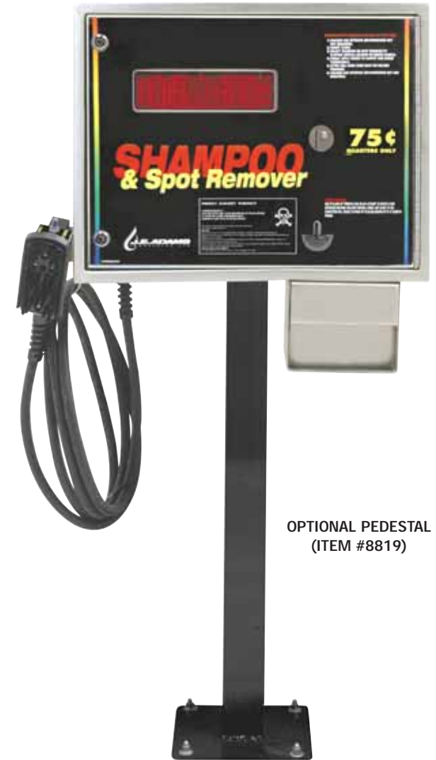
OPTIONAL PEDESTAL (ITEM #8819)