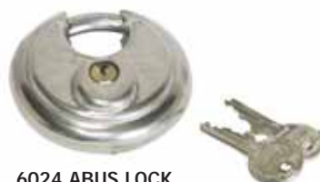
6024 ABUS LOCK