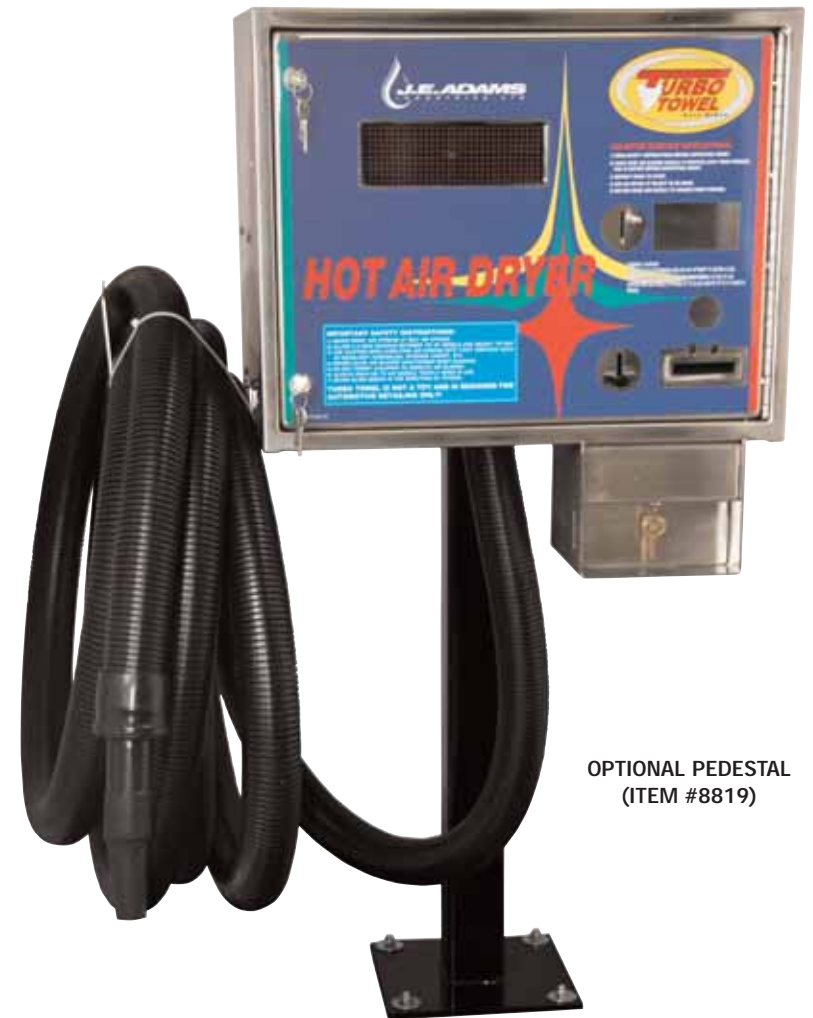
OPTIONAL PEDESTAL (ITEM #8819)

8000-30 Remote control programmer for digital display, 8 oz.