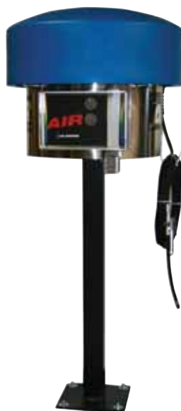
9670 SHOWN WITH OPTIONAL LOCK BAR KIT (ITEM #9670-27A) AND OPTIONAL PEDESTAL (ITEM #8819-50)