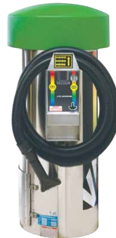
8600LD SILVER TOUCH CLASSIC SHOWN WITH OPTIONAL GREEN DOME