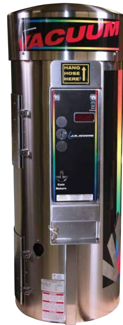
SUPER VAC 9200-4