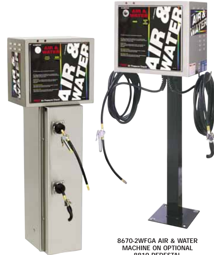
8670-2WBGA AIR & WATER MACHINE ON OPTIONAL 6025 BASE (SOLD SEPARATELY)