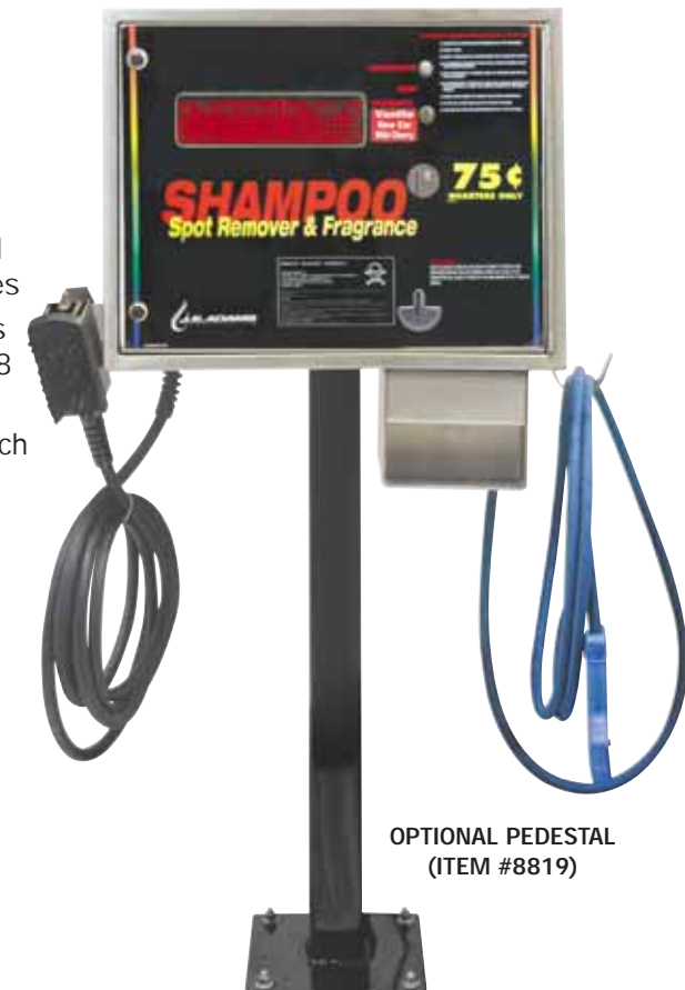
12000 SHAMPOO, SPOT REMOVER & FRAGRANCE STATION SHOWN WITH STANDARD BLACK DECAL