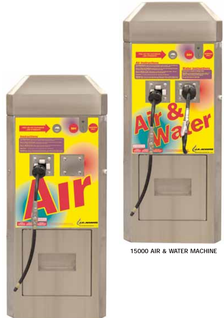
15002 AIR MACHINE