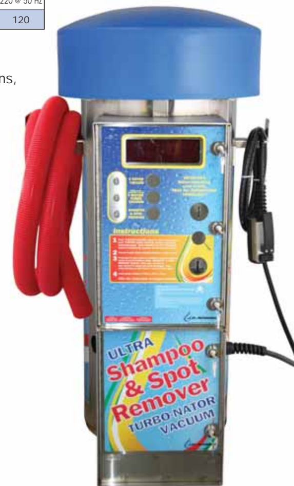
ULTRA SERIES 29003 SHOWN WITH OPTIONAL BLUE DECAL PACKAGE, BLUE DOME, AND RED HOSE