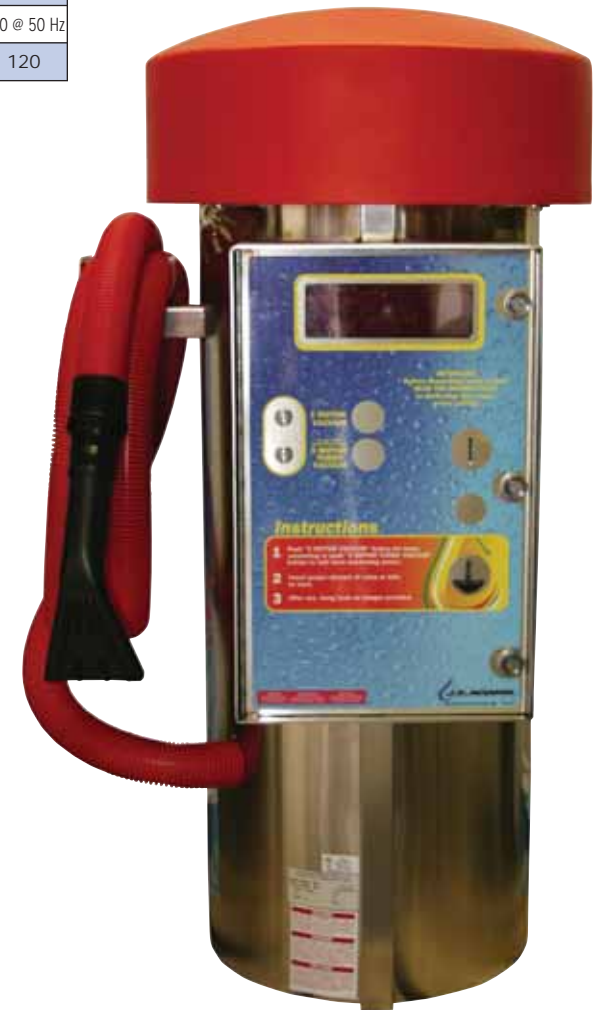
ULTRA SERIES 29027 SHOWN WITH OPTIONAL BLUE DECAL PACKAGE, RED DOME AND RED HOSE