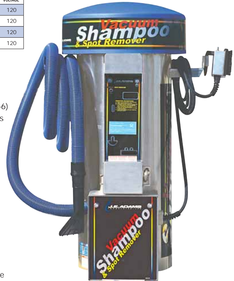
9500 VAC SHAMPOO & SPOT REMOVER SHOWN WITH OPTIONAL BLUE DOME, BLUE HOSE, & COIN BOX SECURITY PACKAGE

8131-10 Remote control programmer for digital display, 8 oz.