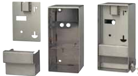
6070 UNASSEMBLED AND 6070 ASSEMBLED SHOWN WITH OPTIONAL DIGITAL FACEPLATE