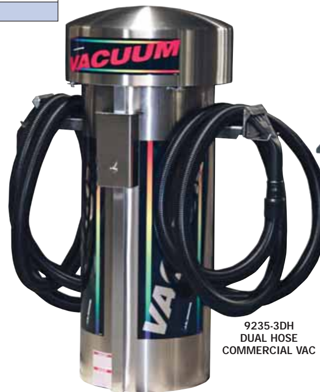
9235-3DH DUAL HOSE COMMERCIAL VAC