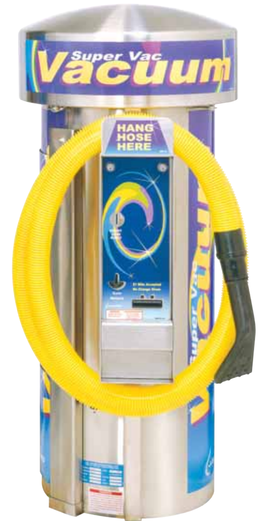
SUPER VAC 9209-6 SHOWN WITH OPTIONAL VIOLET DECAL PACKAGE, YELLOW HOSE, AND SERVICE DOORS SECURITY COVER